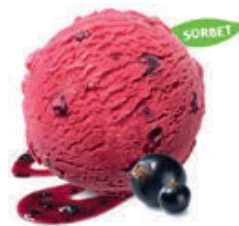
12 BLACKCURRANT & CREAM

Bursting with flavour, raspberry sorbet enriched with raspberry sauce.