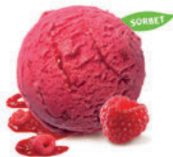
11 RASPBERRY SORBET

With this duet of passion fruit and mango sorbet, you'll feel like you've been carried off to a Pacific Island exotic and delightfully summery.