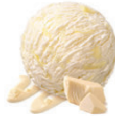
9 WHITE CHOCOLATE

Panna cotta ice cream enhanced with raspberry sauce.