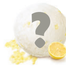
GUEST ICE CREAM

Smoothest Swiss cream paired with delicate, velvet-textured blackcurrant sorbet, enhanced with blackcurrant morsels for an extra touch of fresh-fruit succulence.