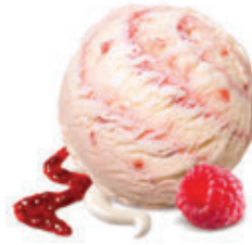
8 PANNA COTTA

The ultimate dream for those with a sweet tooth! Temptingly sweet pieces of caramel in a rich and creamy ice cream.