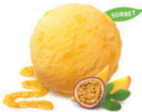
10 PASSION FRUIT & MANGO

A smooth and creamy white chocolate ice cream with rasps of white chocolate.