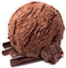
1 SWISS CHOCOLATE

Premium Swiss chocolate shavings blended in a creamy ice cream. The true taste treat for chocolate lovers.