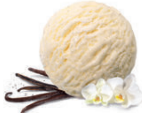
3 VANILLA DREAM

A creamy, fruity and refreshing ice cream embellished with delectable strawberry pieces.