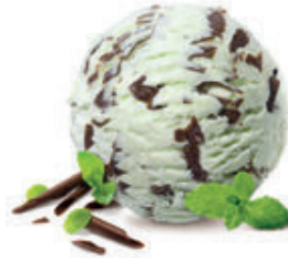
4 MINT CHOCOLATE

Premium vanilla ice cream with real vanilla including the most precious part: the seeds of the vanilla bean.